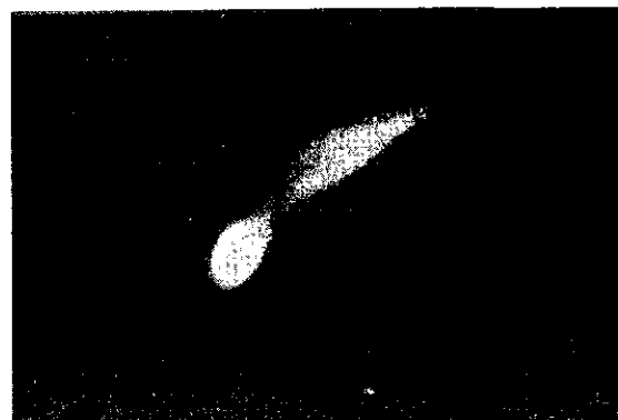
UFO photographed by Astronaut McDivitt

In NASA's annual publication, "Astronautics and Aeronautics," the agency stated that the witness "was unable to identify . . ." the object, and other NASA statements have confirmed that it remained unidentified.